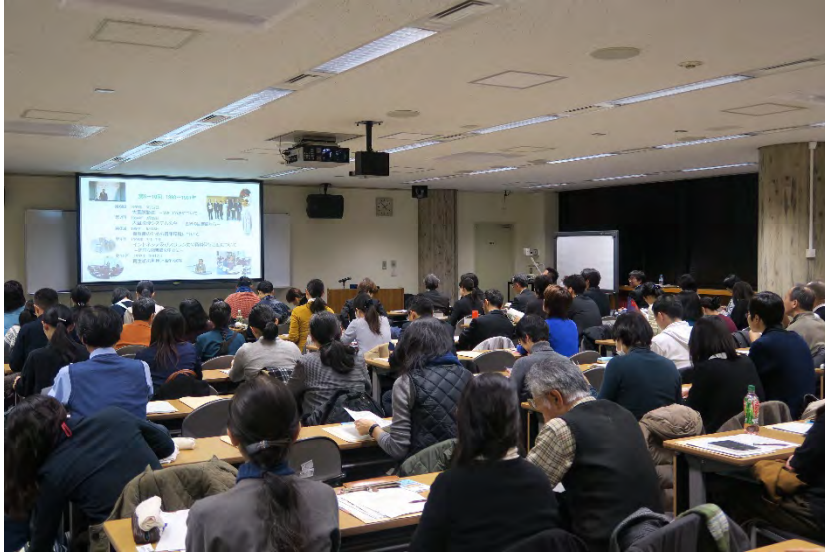
2019 NDL Preservation Forum

Add additional resources and pictures at the end of the document.