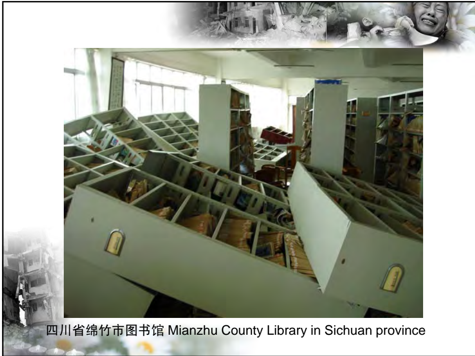
四川省绵竹市图书馆 Mianzhu County Library in Sichuan province