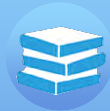
The Public Libraries The Community Learning Centers