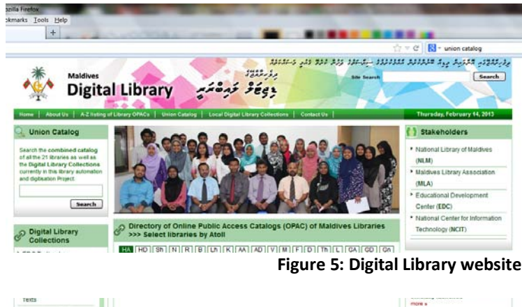
Figure 5: Digital Library website