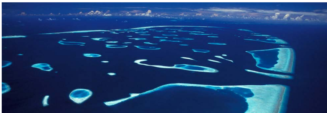
Figure 1: An aerial view of the Maldives islands

The Republic of Maldives is an island nation in the Indian Ocean just across the equator. Maldives consists of 1190 islands formed around 26 ring-like atolls that spread to 90,000 square kilometers. Among these islands 200 are inhabited while 90 islands have been developed into resorts. Tourism and Fishing are the two major industries in the Maldives. Maldives have always been a nation that strives to progress and make outstanding achievements while preserving its heritage.