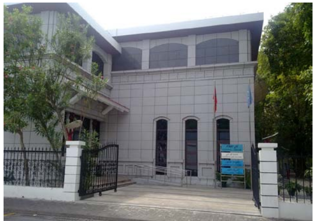
Figure 4: National Library