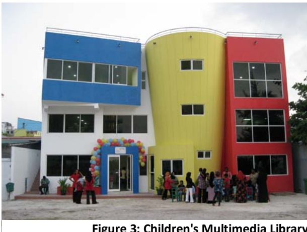
Figure 3: Children's Multimedia Library