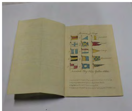
Naval code of signals printed in Madras 1811 used during the British conquest of Java