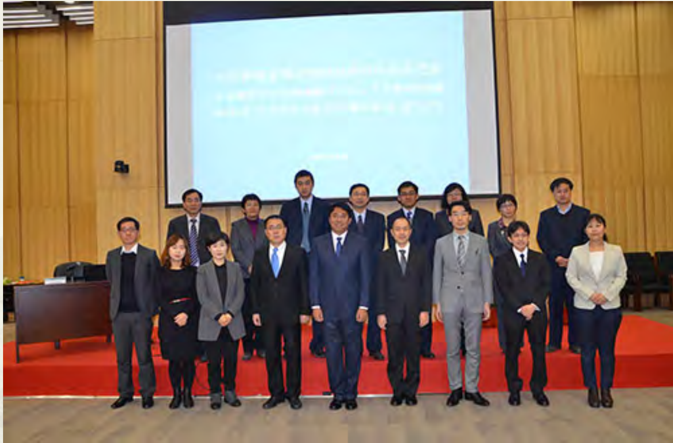
The 4 th Business Meeting of CJK Digital Library, Beijing