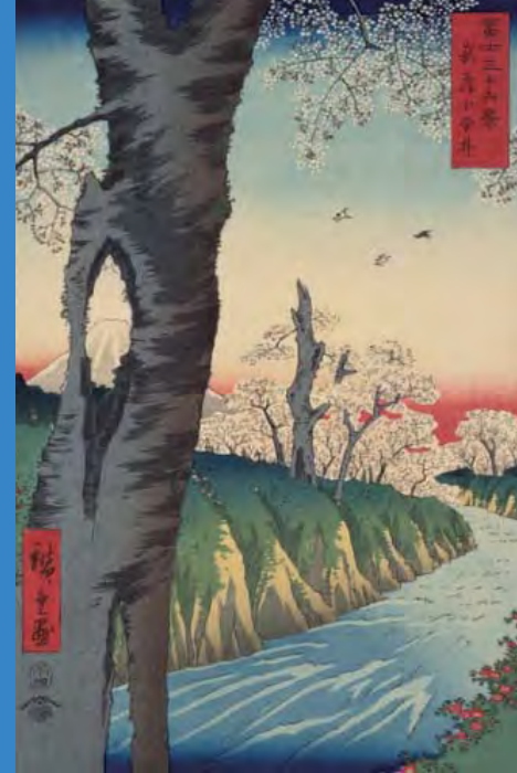
"Thirty-six Views of Mt-Fuji" (From No.203, Dec 2015)