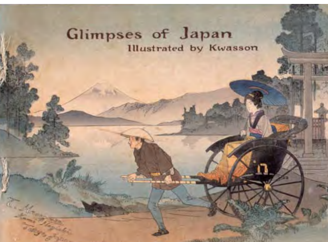
"Glimpses of Japan" (From No.198, Feb 2015)

We appreciate your comments and feedbacks to this newsletter.