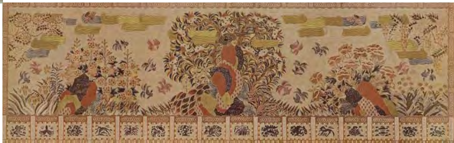
(From No.201, Aug 2015)