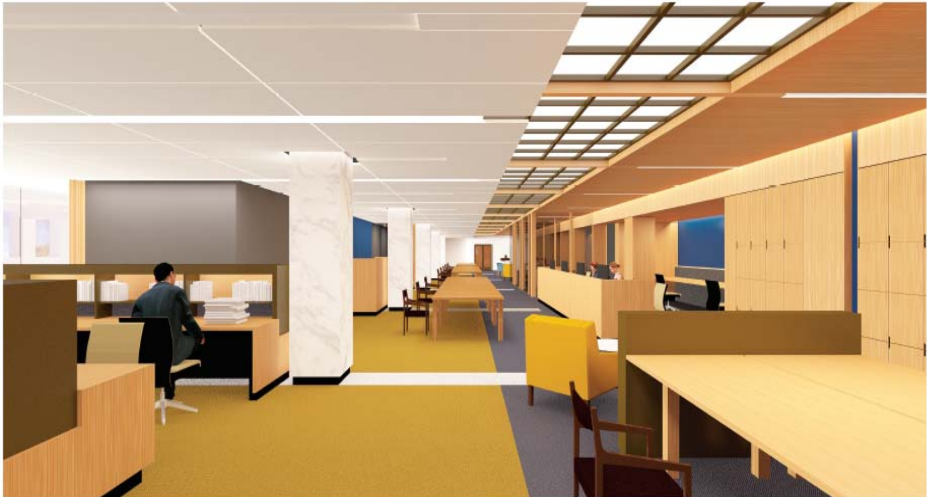
View from new Petherick area looking back to entry