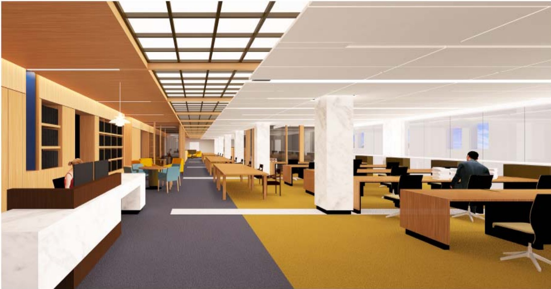
View from entry with service desk to the left