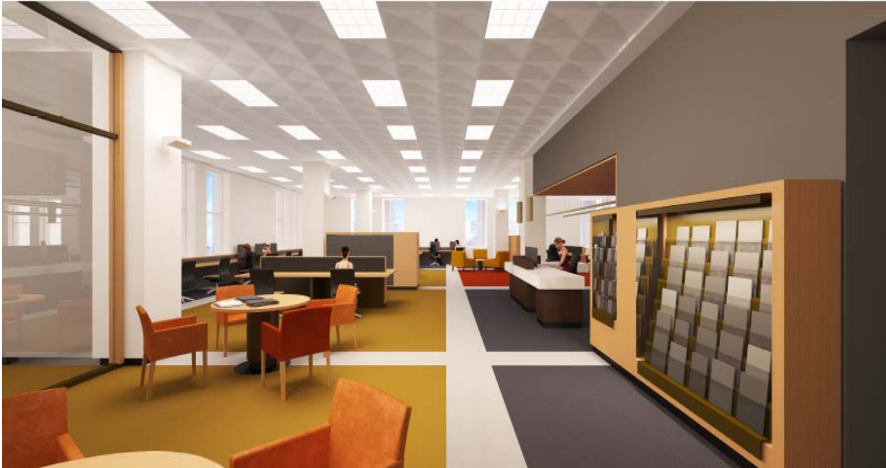
View from Group Work Area to Family History zone