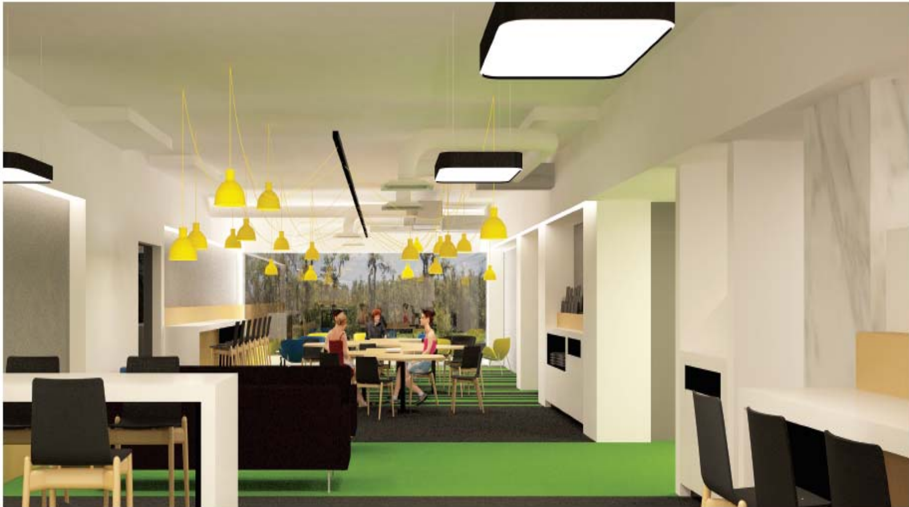
Seating area expanded into current Maps Reading Room