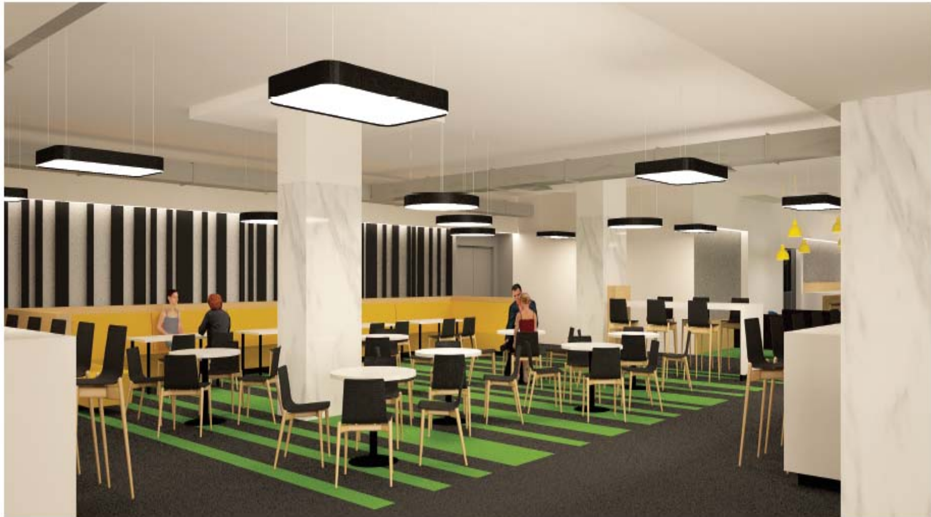
View from Paperplate café showing the expanded seating area