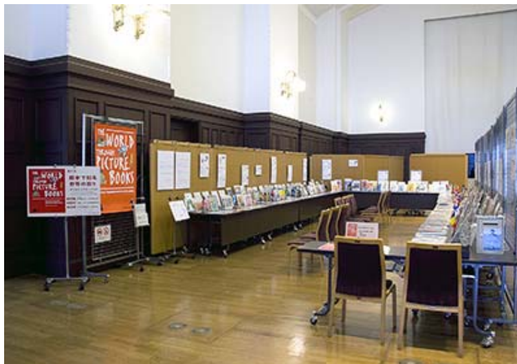
<<Full view of the exhibition in the Hall of the International Library of Children’s Literature>>

The International Library of Children’s Literature (ILCL), National Diet Library offers, a loan service of the exhibition titled “The World through Picture Books—Librarians' favourite books from their country.”