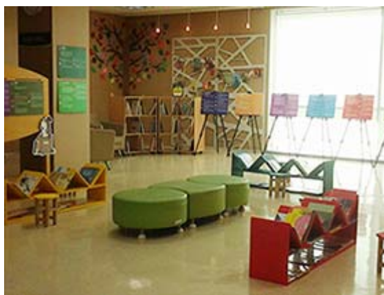
<<Exhibitions at the National Library for Children and Young Adults (left) and the Subong Library in Incheon Metropolitan City (right), Republic of Korea, 2013>>