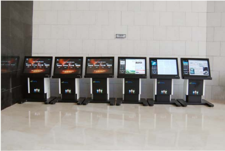
[Electronic newspaper board]